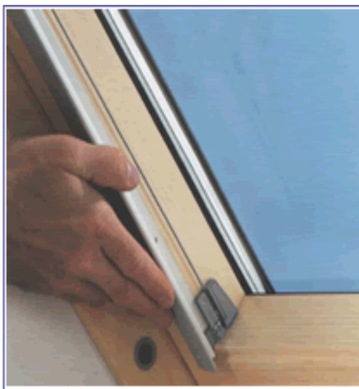
Attach the two aluminium side channels to the bottom of the VELUX roof window