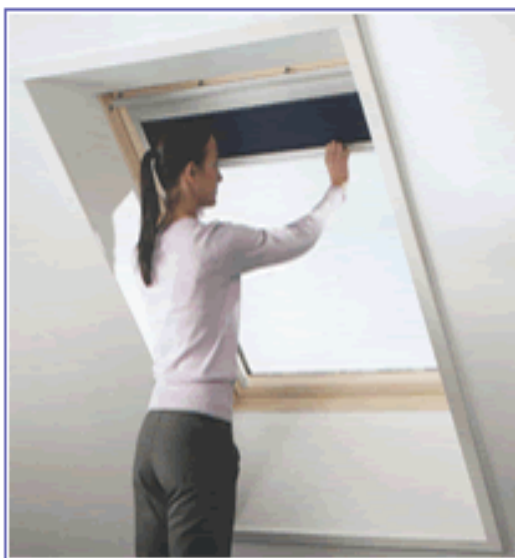
The VELUX blind is now ready for use