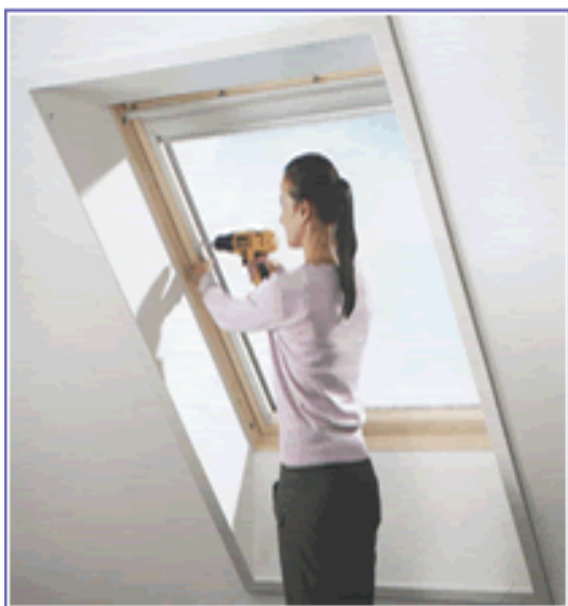
Secure side channels at intermediate points to ensure smooth running action